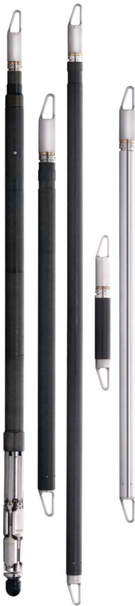
MCI Tool String

The Formation Micro-Conductivity Imager Tool (MCI) provides detailed borehole resistivity image data. Six pads are pushed against the borehole wall by a hydraulic actuating device. The pads closely and consistently make contact with the borehole wall, which is essential to obtaining high quality image data.